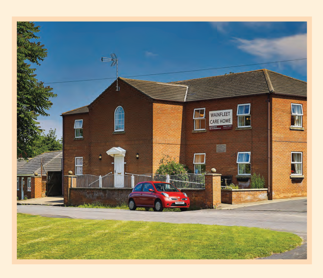
A team that really cares